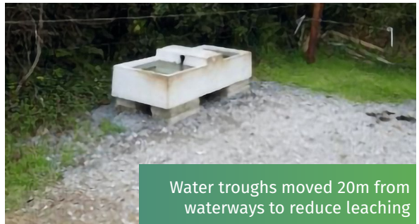
Water troughs moved 20m from waterways to reduce leaching

The main objective of Duncannon Blue Flag and Communities Scheme is to decrease bacterial contamination originating from agriculture in the Duncannon catchment that discharges into Duncannon Beach. The scheme is to reduce nutrient discharges from livestock, agricultural and domestic sources. This should contribute to the recovery and long-term retention of the Blue Flag status at Duncannon beach. The scheme focuses on addressing rural point sources of faecal (and associated phosphorus) contamination. However, it does this within a framework of integrated catchment management, whereby a range of pollution sources and types are considered in unison, for multiple benefits in an integrated, holistic manner. A total of 35 farmers participated in this project, encompassing four dairy, eight tillage, and 23 drystock farmers, covering an extensive area spanning over 975 hectares. Rewards based Pollution Potential Zone (PPZ) maps were utilised to evaluate farm conditions and management practices. Farmers were empowered to select and implement measures tailored to their livestock farms. Several water protection improvement measures were successfully implemented.