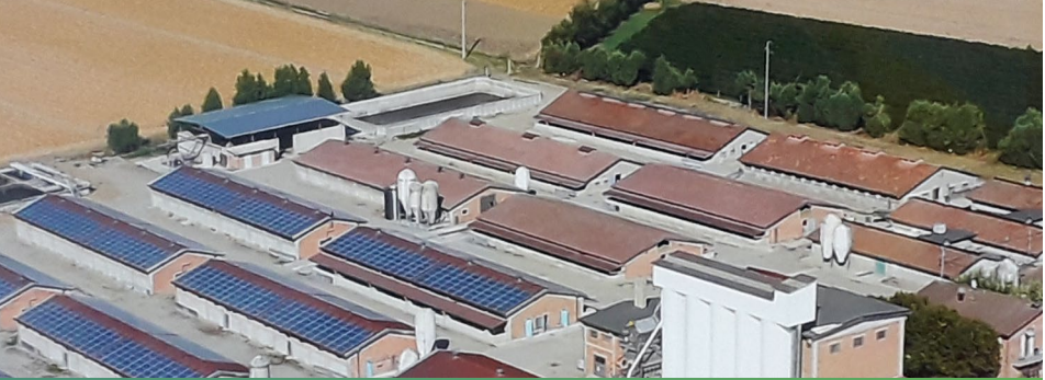
Sant'Anna pig farm, partners of the Gas Loop operational and experimental site