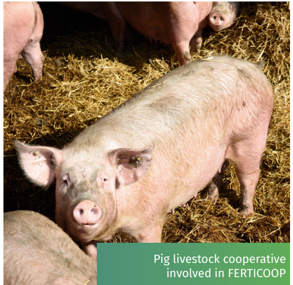
Pig livestock cooperative involved in FERTICOOP

The main objective of the Operational Group FERTICOOP was to develop innovative tools to help the farmers to understand, evaluate and apply the best technologies available (BAT) to reduce environmental impacts of livestock farm, manure management and agricultural fertilisation. The focus was on reducing phosphorus, improving the agricultural management of slurry, to enhance the valorisation and the quality of the extensive crops produced.